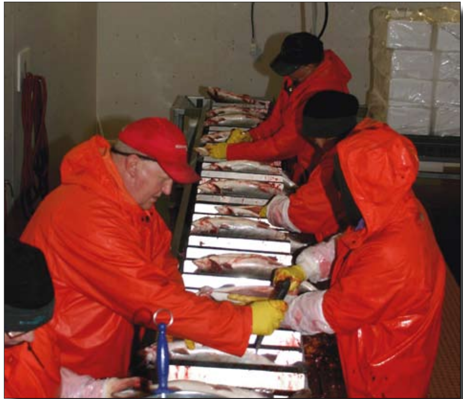
GSU members were happy to return to a regular work day and a sense of normalcy at Wildwest Steelhead's temporary processing facility.